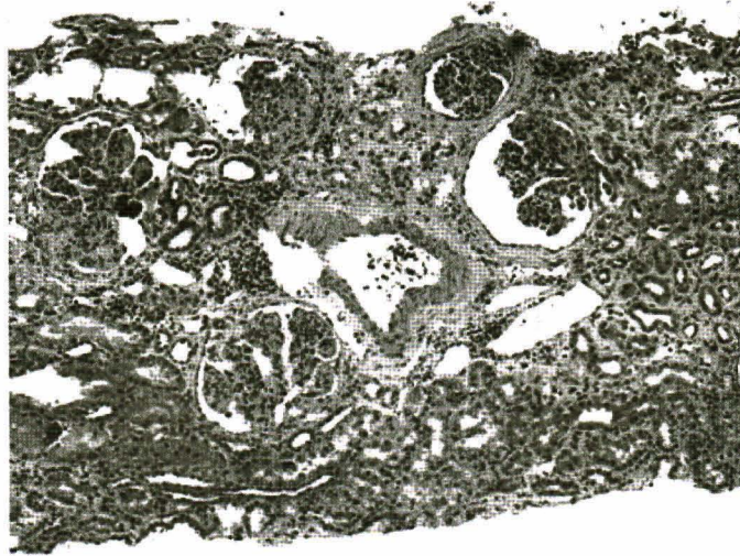
Figure 1. Light microscopy shows patchy interstitial fibrosis and tubular atrophy with moderate interstitial infiltrate of the mononuclear cells.