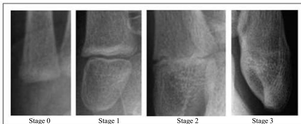
Figure 2. Ossification stages of the distal fibula.

In this study, 181 patients were recruited, consisting of 107 males and 74 females. In 21 out of 181 cases (11.6%), two or more visits to the hospital with repeated radiological examination were found. As a result, a total of 217 ankle radiographs were eligible for the study. As shown in Table 1, the distribution of the subjects by age and sex is present.