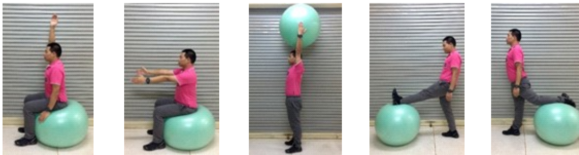
Figure 1. Pattern of exercise with the ball.

and standard deviations (SD) was applied to explain baseline demographics and blood pressure. student unpaired t - test (mean ± SD and 95% CI) to compare between groups and student paired t - test (mean ± SD and 95% CI) to compared in group was applied to explain functional performance. The level of significance was set up at P < 0.05.