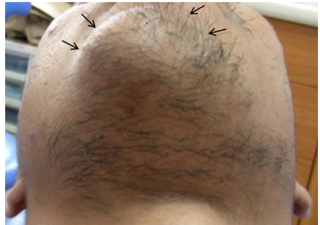
Figure 1. Round shaped mass on the right side of the chin.

Intraorally, the oral hygiene appeared to be fair in general with two retained roots on the right and