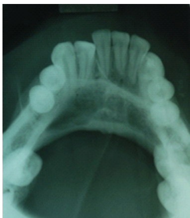
Figure 3. The lesion was surrounded by discontinuous sclerotic border showing bone perforation and there was bone expansion at buccal surface of the right side of the mandible.

The patient underwent needle aspiration but the result yielded negative finding. Then, the lesion was excised by incisional biopsy under local anesthesia. The histopathology revealed a schwannoma. The treatment plan was enucleation under general anesthesia. A buccal flap was reflected, then the tumor was totally enucleated. Grossly, the lesion composed of two soft tissue masses. Each mass was 3 cm. in diameter with fat-like texture, pale yellow in color and soft to firm in consistency. The