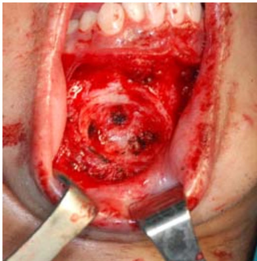
Figure 6. After enucleation, the bone was cupping indicating that the tumor was intraosseous lesion.