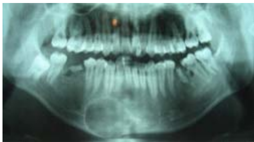
Figure 2. The lesion in panoramic radiograph illustrated a round shaped unilocular heterogeneous radiolucency on the basilar part of the mandible from right lower central incisor to right lower second premolar region. It was surrounded by a sclerotic border which expanded to the inferior border of mandible.