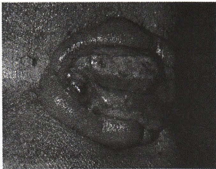
Figure 1. Prolapsed thrombosed hemorrhoid.

Urgent hemorrhoidectomy with closed technique can be performed for prolapsed thrombosed hemorrhoids, with no difference in complication from elective operation.