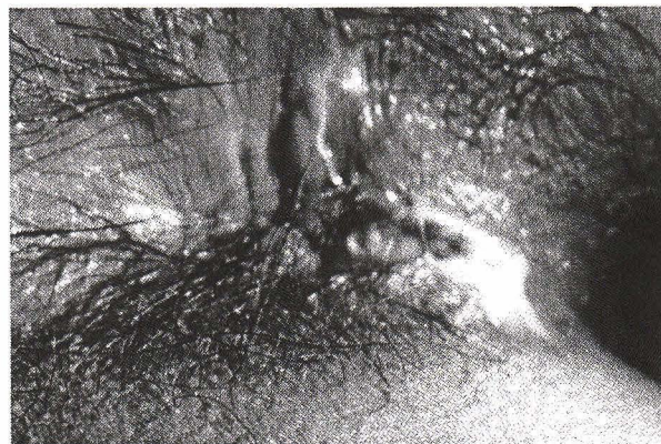
Figure 3. Wound dehiscence.