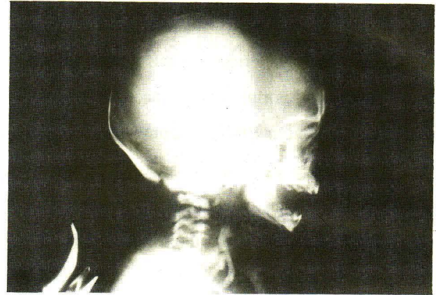
Figure 2. Skull X – ray demonstrates the absent of diploic space in this patient.

diagnosis in the neonatal period may be difficult because some clinical manifestations such as growth retardation and eye abnormalities may not be presented during this period. In addition, X-rays of the long bones are not routinely performed for hypocalcemic seizures. The condition may be misdiagnosed as pseudohypoparathyroidism because of the short stature, and hypocalcemia suggests a spectrum of pseudohypoparathyroidism. However, the shortened fourth metacarpal bone and metastatic subcutaneous calcification would not Franceschini et al (2) reviewed the previously reported cases and showed that more than 90 % of the patients had short statures, cortical thickening with medullary stenosis of the long bones and delayed fontanelle closure, but three patients reported by Majewski et al (6) showed no medullary stenosis. Eighty five percent of reported cases had hypocalcemia, but low parathyroid hormone was found in only 60 %. Boynton et al (7) also reported a Kenny-