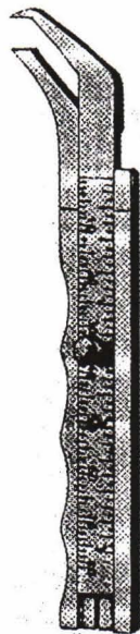
Figure 1. Thorpe caliper, angled - slide rule type caliper, graduated 0 mm to 80 mm in 1 mm increments and 0 to 3 inches in 1/16 inch increments. Features 3 mm, angled tips and thumbscrew for locking caliper (Padgett Instruments, inc.)

The medial interorbital distance (IOD) is defined as the distance between bilateral dacryons (junction of the frontal, lacrimal, and maxillary bones) (8) (Figure 2). Measured data was collected, summarized, and analyzed as mean and standard deviation according to sex and age.