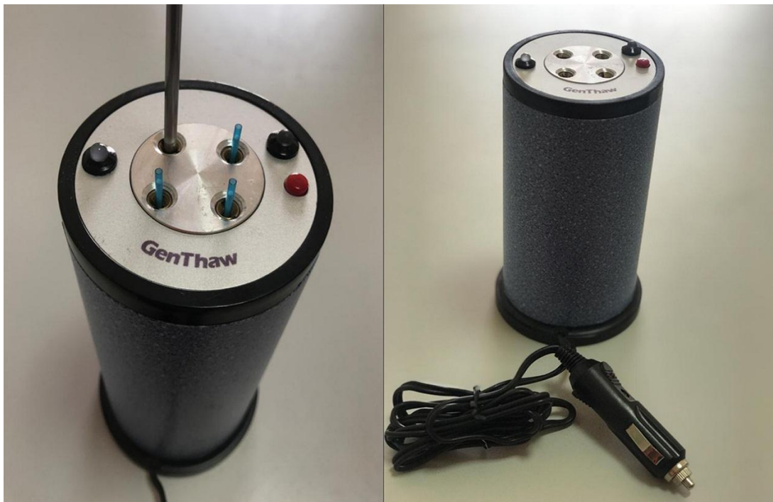
Figure 1 Device of dry thawing method.