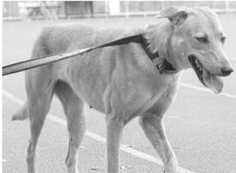
Figure 1 The appearance of the Thai native dog.

In type 2a, the CMA and CT branched off from the CMT, after that, the CT trifurcated into the hepatic, left gastric and splenic arteries whereas in type 2b, the first two branches of the CMT were the hepatic and left gastric arteries followed by the bifurcation of the splenic artery and the CMA.