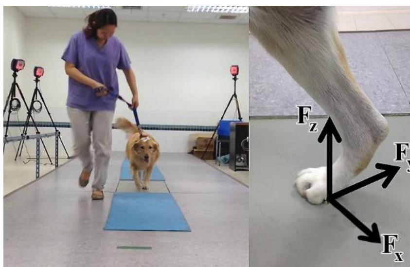
Figure 2 Schematic illustration of PVF measurement using computer assisted force plate gait analysis to measure vertical ground reaction force ( F_z ), craniocaudal ground reaction force ( F_y ) and mediolateral ground reaction force ( F_x )

handler throughout the study. Patient's velocities were measured by a set of 3 laser sensors positioned 2 meter apart. The velocity of each subject was controlled to a range that the difference in maximum and minimum velocities was less than 0.3 m/sec throughout the study. The ground reaction force measured by the force plate was preprocessed by proprietary software (Cortex 4.0, Motion Analysis Corporation, Santa Rosa, CA). The PVF values from the first three valid trials were normalized with respect to patient's body weight (%BW) and then averaged to use as representative data for statistical analysis. In bilateral hip osteoarthritis patients, the limb with lesser weight bearing force measured by the objective force plate gait analysis was selected for treatment assessment.