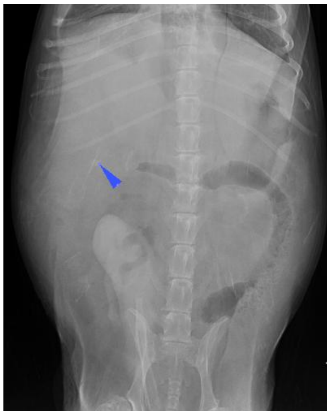
Figure 2 The ventrodorsal projection of abdominal radiograph revealed a well defined, round to oval shape, radiodense material (7 x 7 mm, arrow head) at the right cranio-paramedial abdomen which the same area of the right renal pelvis. In addition, the intervertebral space with osteosclerosis and lateral bone spurs were detected between the intervertebral disc space of L2 - L3 and L3 - L4.