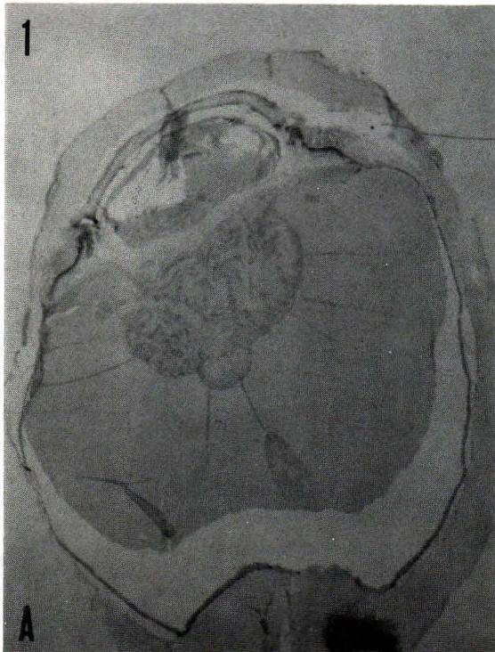
Figure 1A. Macrophotomicrograph of retrolental medulloepithelioma (case 1).