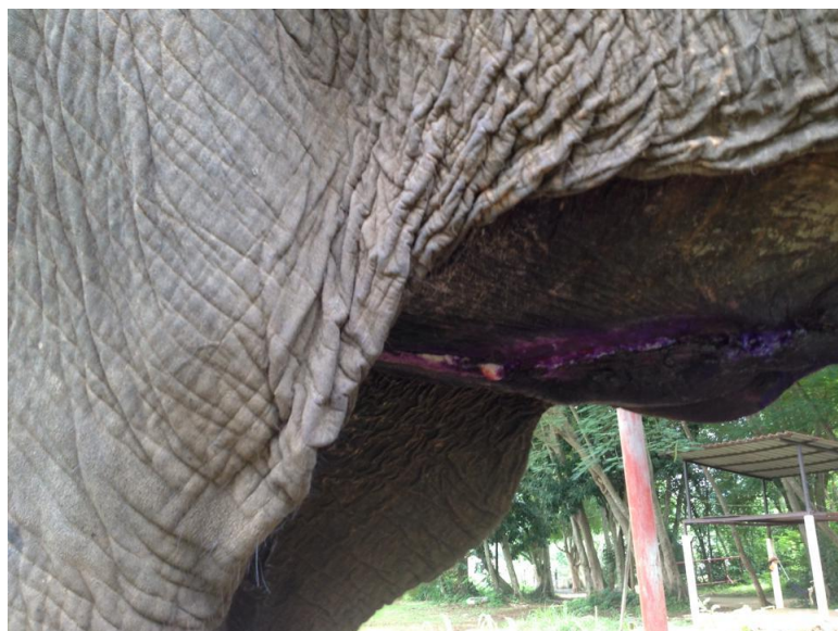
Figure 2 Necrosis following urine scalding through umbilicus

(Catosal®, Bayer Health Care, Kansas, USA) at a total of 50 ml was intramuscularly administered every 2 days over a 30-day period. The accumulation of urine under the subcutaneous tissue and the urine scalding led to pustular exudates and necrotic tissues around the surgical wound. The necrosis covered the base of the incision line through umbilicus (Fig 2). The wound was then cleaned and the necrotic tissues were removed daily. Then, both necrosis points were pierced through skin in the same way behind the vulva opening and all urine flowed out this way. After the operation, the elephant had good appetite and was able to defecate normally. Two months of wound cleaning and trimming were performed. During the early phases of healing, the elephant urinated through the episiotomy wound. However, the wound healing increased daily. New urine subcutaneous tract under the surgical wound was formed behind the vestibule and vulva. Finally, the surgical wound completely closed and the new tract was completely formed (Fig 3). At present, like other female elephants, the elephant could urinate via the new tract with large amount of urine (Fig 4). However, sometimes, urinary incontinence still occurred and stained the hind limbs of the elephant. Fortunately, her overall health was not affected.