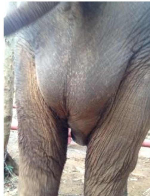
Figure 1 Perineal urine ballottement after urethra rupture and leakage at the episiotomy and urethrotomy wound

Laboratory tests: Pre-operative blood examination via auricular vein puncture was conducted. Hematological profiles, liver enzyme and kidney function were within normal limits.