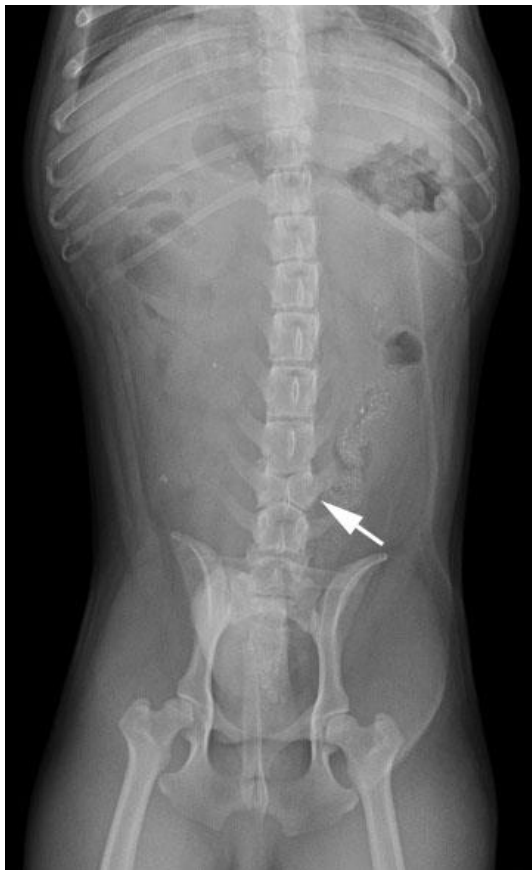
Figure 2 The ventrodorsal abdominal radiograph showed the congenital abnormality of the 6 th lumbar vertebral body by the medial hypoplasia that caused that vertebral body represent as the butterfly shape (arrow).