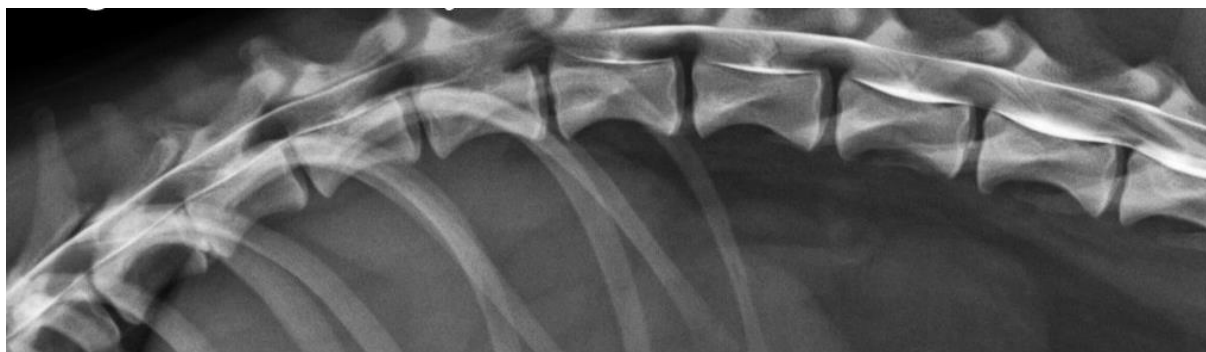
Figure 1 There is dorsal displacement of the ventral aspect of subarachnoid space, containing contrast medium (white arrow) at T13-L1.

e average recovery time of grades 2, 3 and 4 after hemilaminectomy plus electroacupuncture and aquapuncture