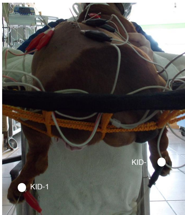
Figure 4 The view of electroacupuncture used on acupoint KID-1 in a Dachshund after hemilaminectomy.