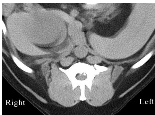
Figure 2 CT myelography shows the mineralized intervertebral disc herniation (black arrow).