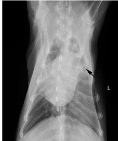
Figure 2 Ventrodorsal projection of the thoracic radiograph showed the small, air-filled pockets at the left side (arrow).

(asterisk) (Fig. 1) whereas other thoracic information, such as cardiac size and the rest of pulmonary parenchyma revealed normal appearances. On the ventrodorsal thoracic radiograph, the sternal deformity was hardly detected in according to the superimposition to the sternum. The pulmonary parenchyma was increased radiopacity on the left hemithorax and superimposed with the skin fold. At the cranial lung lobes, there was evidence of the small, air-filled pockets at the left side (arrow).