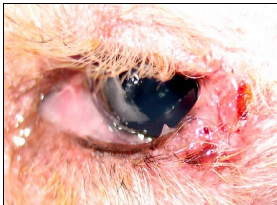
Figure 1 A photograph of the left eye of the Fox Terrier; illustrating open periorcular wounds. (For better quality of photographs, please visit the TJVM website)

The dog was bilaterally visual. Ophthalmic examinations of the left eye revealed lachrymation but yet negative fluorescein staining test. Hyphema or globe rupture was not indicated. Two small wounds were observed at the temporal aspect of the swollen eyelid.