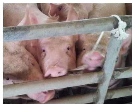
Figure 2 Oral fluid collection using cotton rope

72°C. Fluorescence was detected at the end of the extension step. Internal PCR-product plasmids were cloned by pGEM easy Vector System I (Promega, USA), transferred to JM109 (Promega, USA), amplified and used as standard DNA.