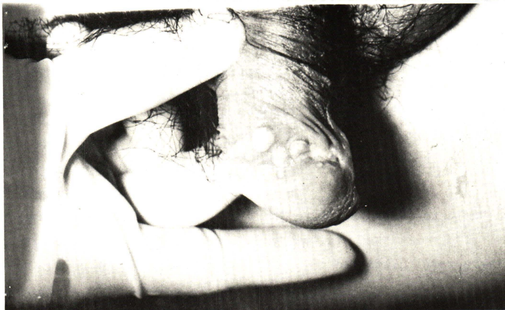
Figure 1 Multiple ulcers in chancroid.