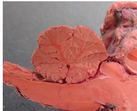
Figure 2 Sudan Red III staining was apparent in the arbor vitae of the cerebellum, which is the white matter.