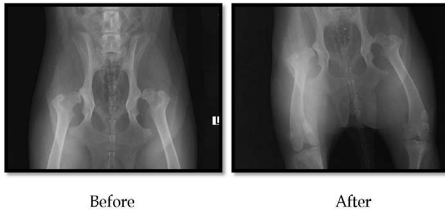
Figure 1 Radiographs showed non-progressive OA at hip joints after PCSO-524 administration for three months.