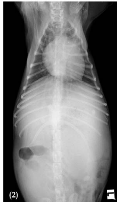
Figure 2 Ventrodorsal radiograph

Give your diagnosis and turn to the next page.