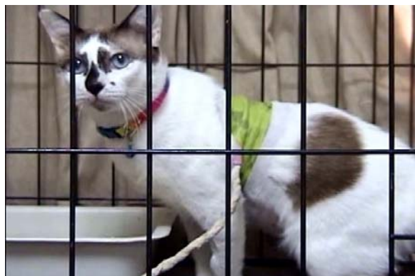
Figure 3 For the tests, cats were moved into laboratory and housed singly in cages. The probe is placed in contact with cat's shaved skin by placing an elastic band around cat's thorax.

were made at 15 min intervals before any drugs were administered and their mean values were taken as the basal thermal thresholds. Each cat randomly received an intramuscular administration of tramadol (Tramal®100, Grünenthal GmbH, Germany) 2 mg/kg (tramadol group), morphine 0.2 mg/kg (morphine group) and saline 0.04 ml/kg (control group) as a three period cross-over study with a weekly interval from an observer unaware of the treatment.