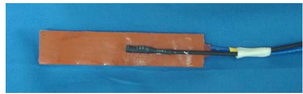
Figure 1 Probe containing a heater element, 12.5 cm long, 2.5 cm wide and 0.1 cm deep and a center temperature sensor.

Thermal threshold testing device: The cats' thermal thresholds were measured by applying a mild, transient heat stimulus to elicit pain. The cats were observed until they reacted; the probe's temperature