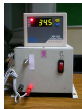
Figure 2 A temperature digital monitor showing an increase in thermal temperature with 0.5°C/sec increments and a control unit providing safety for cats from skin thermal stimulation by an automatic safety cut-off switch.

Procedures: On the day before testing, the craniolateral thorax was shaved. On the day of testing, the cats were transported to the laboratory and housed individually in cages with a litter tray and positioned in a quiet environment. The probe was held against the shaved thoracic skin of the cat with a 2 inches wide flexible cohesive bandage (Fig 3). A minimum of 5 min was allowed for the probe to reach skin temperature. The thermal thresholds were measured on eight unrestrained cats as described by Dixon et al. (2002), and recorded by activation of the heater until the cat showed a positive response (e.g. skin flicks, turning and looking at the probe and jumping forwards). Three baseline measurements