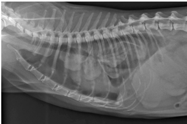
Figure 1 Right lateral thoracic radiograph

Plain right lateral and ventrodorsal thoracic radiographs were taken after 2 nd thoracocentesis was performed to evaluate the remained pleural fluid and the other thoracic abnormalities.