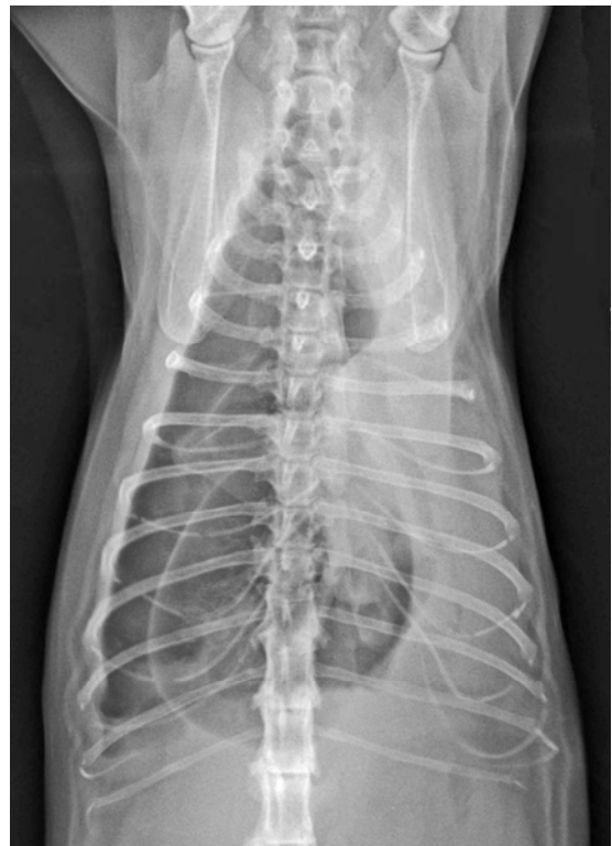
Figure 2 Ventrodorsal thoracic radiograph

Give your diagnosis and turn to the next page.