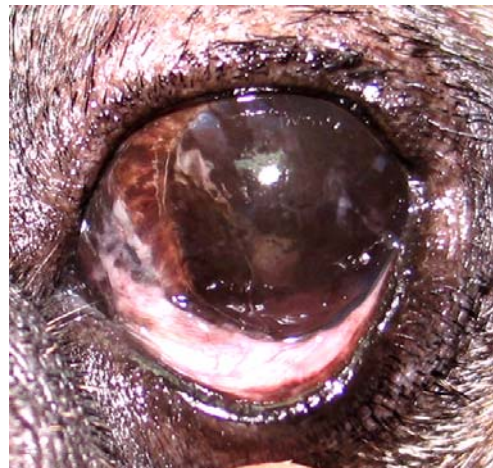
Figure 2. Photograph of the left eye of the same Pug from close ophthalmic examination.

(For better quality, figures can be viewed in the TJVM website)