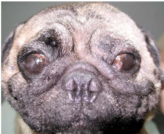
Figure 1. Photograph of this female Pug. (front view).