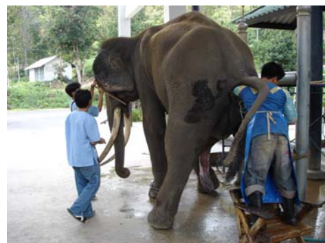
Figure 1. Semen collection by manual rectal stimulation in Asian elephant ( Elephas maximus ).

A total of 54 attempts of semen collection were performed (Figures 1 and 2). Forty one ejaculates (75.92%) without urine contamination were obtained and 13 ejaculates (24.08%) contaminated with urine were discarded. The level of seminal calcium concentration was 9.21 \pm 0.85 . The results showed that calcium level in seminal plasma was negative correlated with progressive motility ( R^2 = 0.1721 ) ( p < 0.05 ). Seminal calcium was not significantly correlated with sperm concentration, volume, pH and percentages of abnormal morphology and dead sperm ( R^2 = 0.0037, 0.0125, 0.0267, 0.1110 and 0.0442 , respectively) (Table 1).