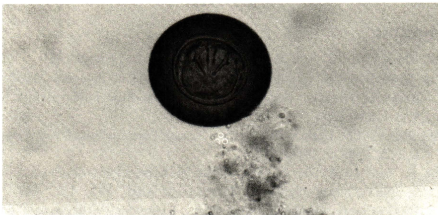
Fig. 2 Egg of Hymenolepis diminuta in stool specimen.

The eggs measured about 65 \times 63 microns. They were slightly ovoid in shape and brown in color (Fig 2). The