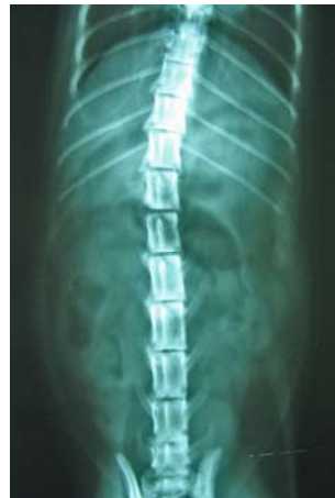
Figure 1 Right lateral (A) and ventrodorsal (B) abdominal radiographs.