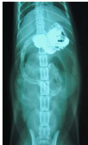
Figure 2 Right lateral (A) and ventrodorsal (B) abdominal radiographs taken at 2 hours after barium sulphate suspension administration.

Give your diagnosis and turn to the next page.