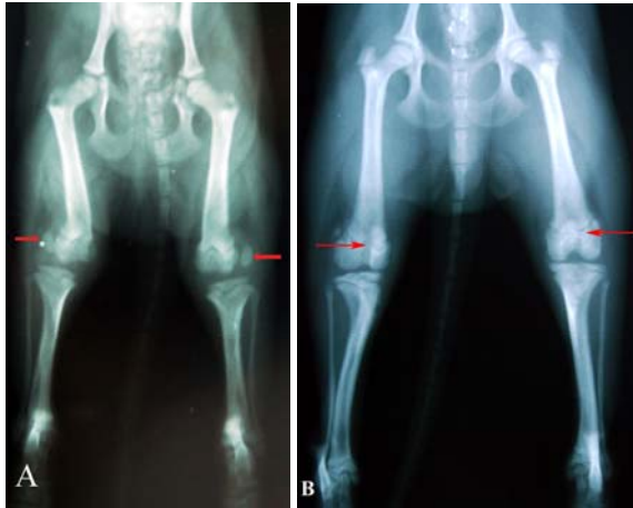
Figure 1. Ventrodorsal radiographs of both hindlimbs in the first dog: A: patella luxated laterally; B: patella stayed in the normal position 2 months after surgery (arrows).

taken while the patella was out of the trochlear sulcus in order to evaluate limb alignment (Figure 1). Skyline views of the stifle joint were made preoperatively and postoperatively to evaluate the depth and contour of the femoral trochlea (Figure 2). Radiographs of all dogs illustrated patellar luxation on the lateral site with either absent or convex trochlear sulcus.