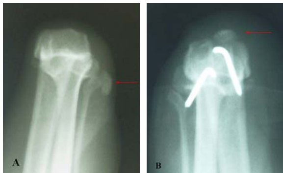
Figure 2. Skyline radiographic views of the left hindlimb (case 3) illustrated the patella luxated laterally (A) and in the trochlear sulcus after surgery (B) (arrows).

Physical examination and blood analysis were performed preoperatively. Acepromazine 0.02 mg/kg and morphine 0.5 mg/kg were administered as premedications. Fifteen-thirty minute after the premedication, anesthesia was induced with propofol to effect and maintained with isoflurane in 100% oxygen. Prophylactic cefazolin 25 mg/kg is administered intravenously.