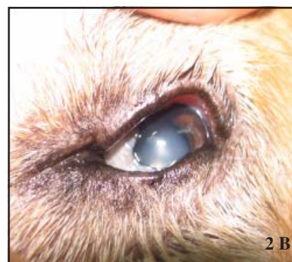
Figure 2. Photograph of the left eye at (A) day of surgery after the mass was surgically excised followed by electrotherapy and (B) two weeks after surgery.