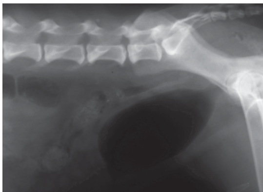
Figure 2. Negative-contrast cystograph