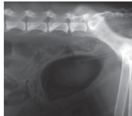
Figure 3. Double-contrast cystograph

Give your diagnosis and turn to the next page.