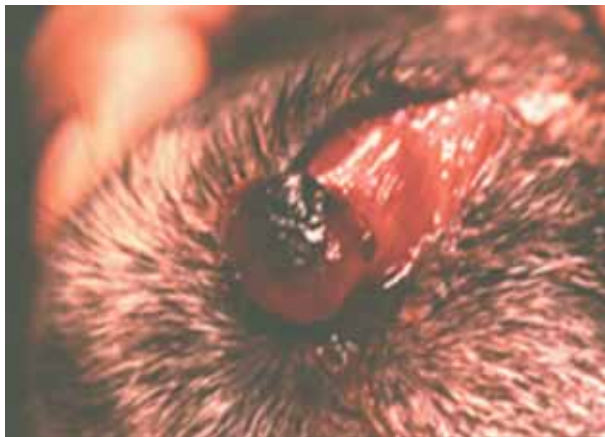
Figure 1 Hemangiosarcoma of the nictitating membrane. A solid, proliferative, dark red mass was located at the palpebral conjunctiva of the left nictitan in a 7 year-old Great Dane.