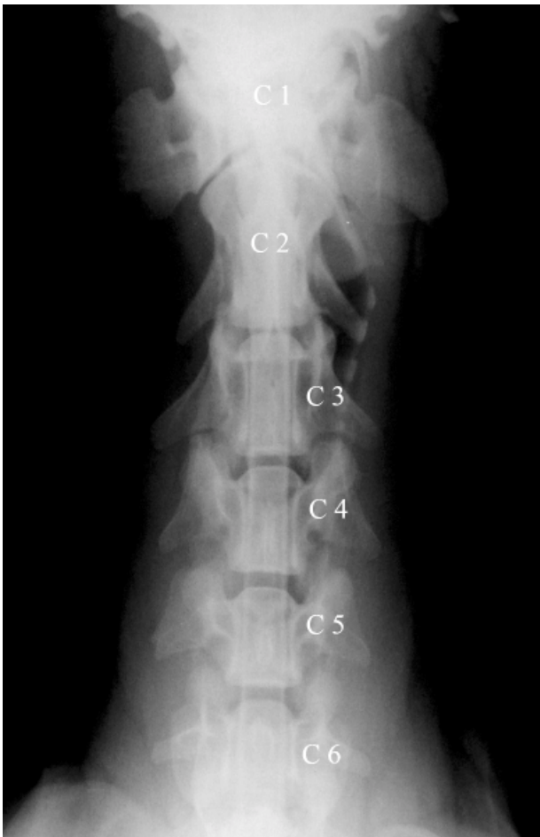
Figure 1 The ventrodorsal myelogram of the cervical spine