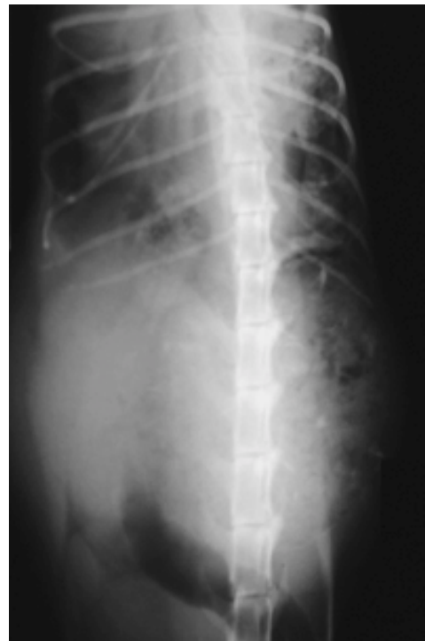
Figure 2 Ventro-dorsal view of an abdomen of the same cat.