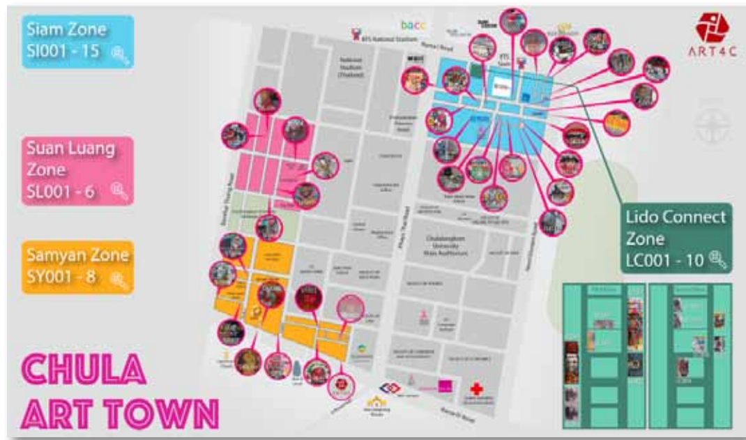
Figure 1. Chula Art Town's 4 zone map.

In google lingo there are five “Stories” or sections with the first titled Chula Art Town, A Public Art Space for the Community followed by 4 “zones” or neighborhood art clusters going by local names: Siam, Lido Connect, Suang Luang and Samyan.