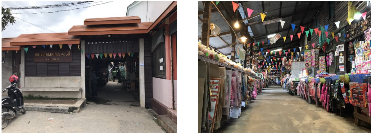
Figure 3: Centenary Khlong Suan Market, Chachoengsao Province. May 28, 2018.